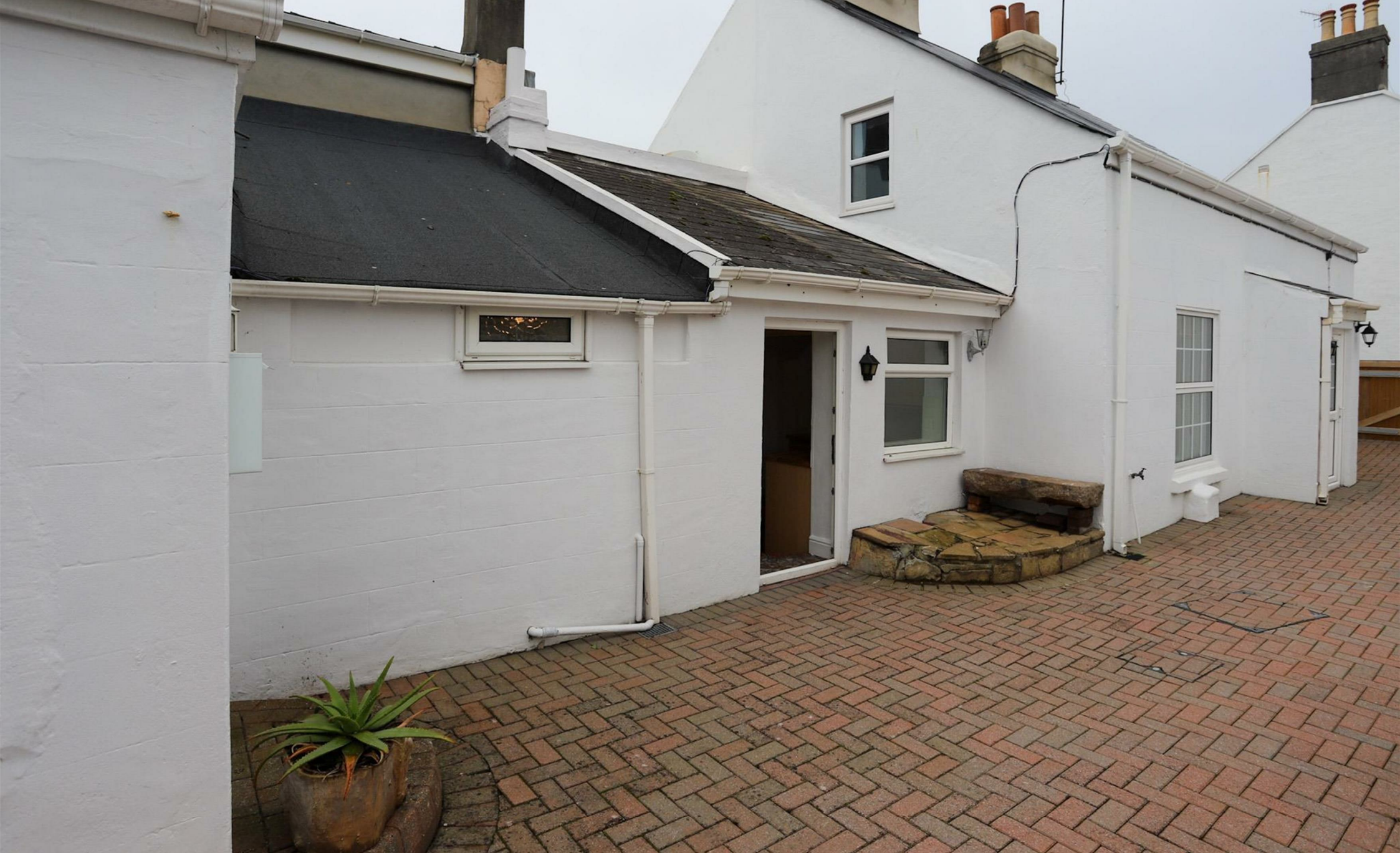
5 Byron Lane, St Helier, Jersey, JE2 4LG £595,000